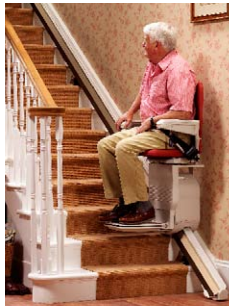
3. Gentle pressure on the directional controls positioned on the arm is all it takes to make your stairlift move smoothly up or down the stairs.