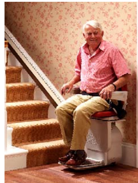
2. Once unfolded, make yourself comfortable in the seat. Use the safety belt for extra security if you choose.