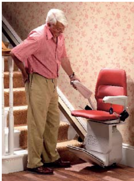
1. Unfolding the Saxon is exceptionally easy. Pull down the seat, followed by the chair arm and the arm-to-footrest link will automatically lower the footrest down too.