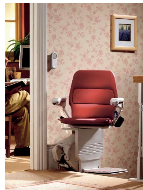
5. You can leave the stairlift in its swivelled position at the top of the stairs as an effective safety barrier or fold it flat against the wall.