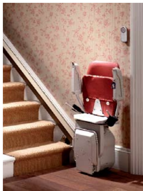
6. When not in use, the stairlift can be folded flat against the wall so it takes up less space in your home and leaves the stairs clear for other users.