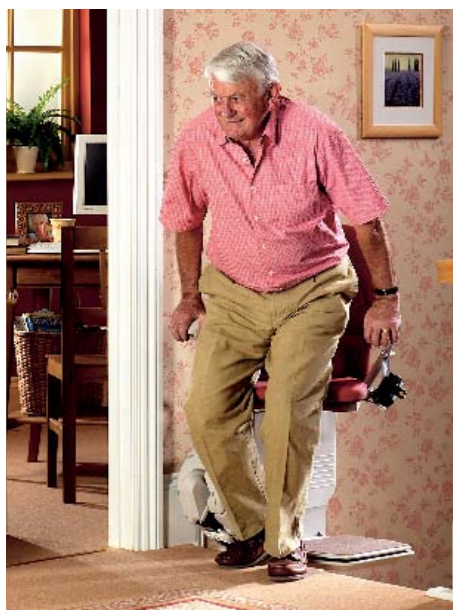
4. When you reach the top of the stairs, you can swivel the chair round to face the landing so you can get off in complete safety.